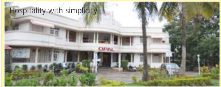
Hospitality with simplicity

Totally Chilled Out, Yet Fully Hot! www.kolhapurtourism.com